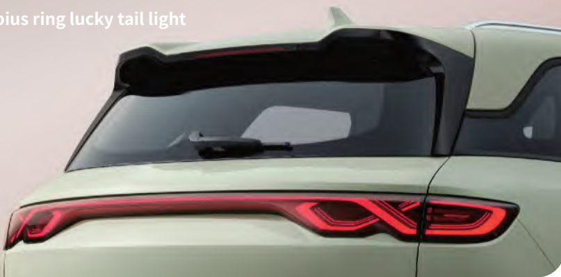
Mobius ring lucky tail light